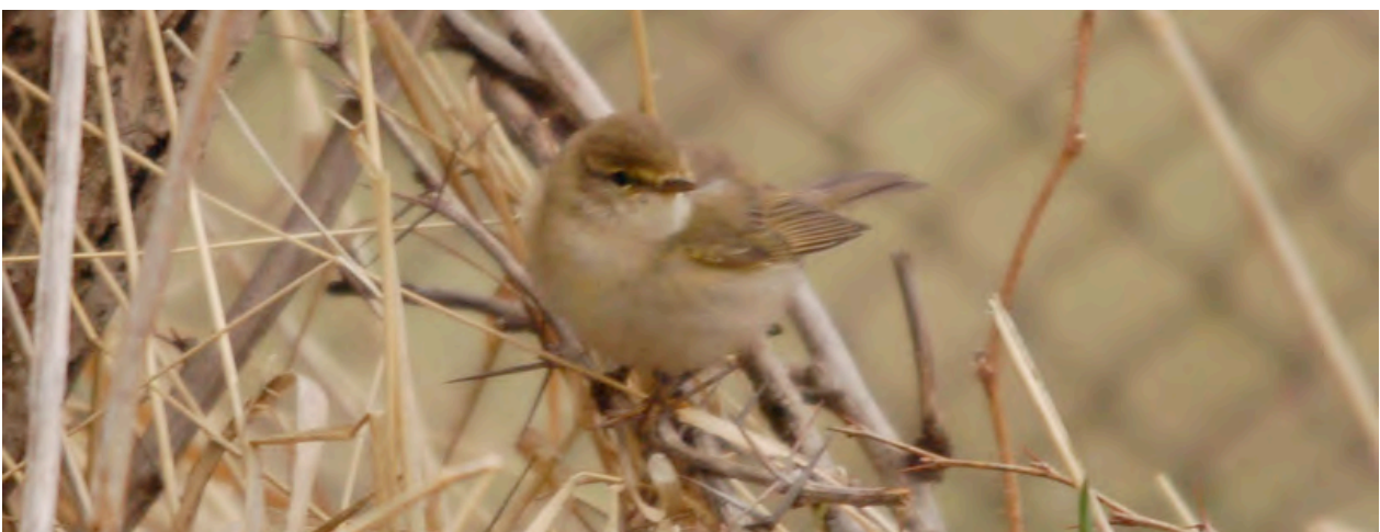
Picture 12: Chiffchaff sp. 22.04.2011, Stephansminda.