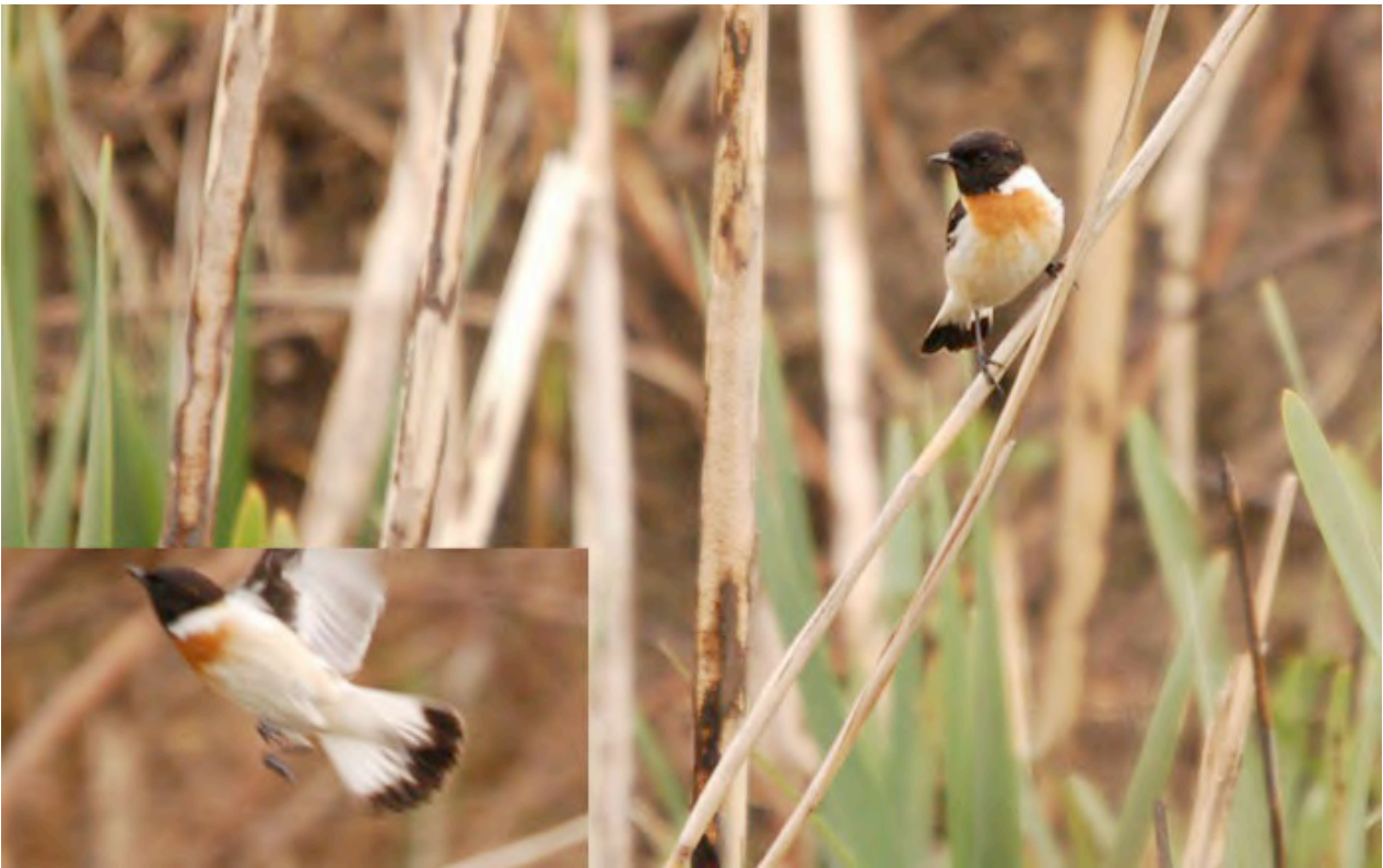
Picture 10: Stonechat ssp. variegatus. 24.04.2011, Mtskheta.