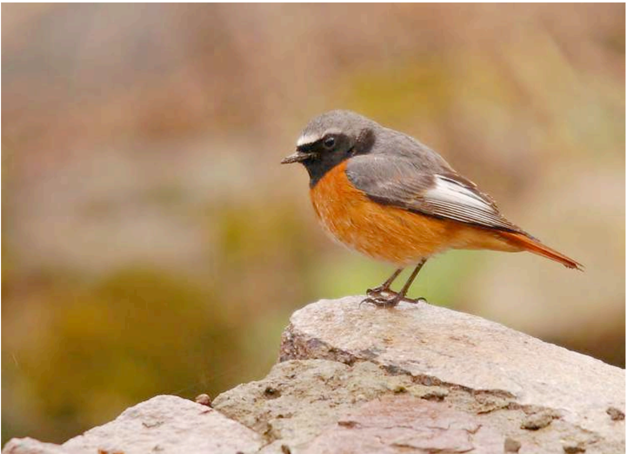
Picture 8: Common Redstart ssp. semirufus. 24.04.2011, Anauri.

Subspecies samamisicus very common in Kojori, Tbilisi and other villages/towns outside of the Caucasus. Less common in Stephansminda. Some nominate race migrants noted all along the trip.