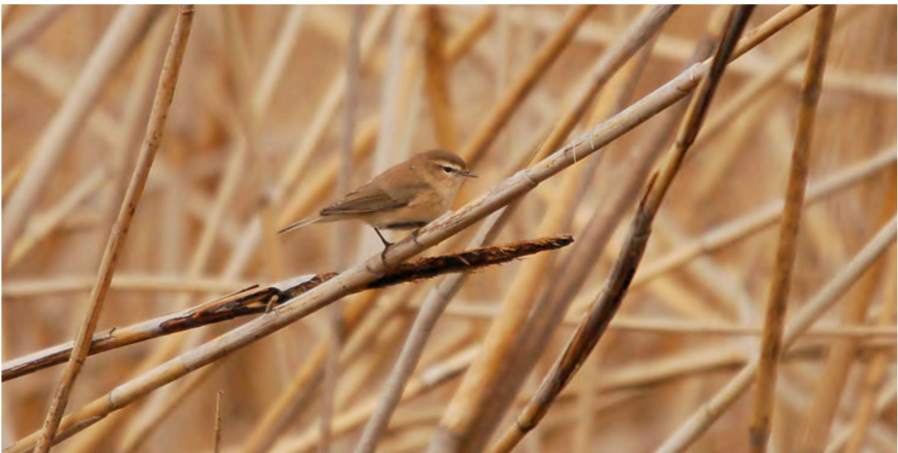
Picture 11: Caucasian Chiffchaff. 24.04.2011, Mtskheta.

Only one bird identified in Mtskheta on 24.04. (see image). Some possible birds noted around Stephansminda (where Common Chiffchaff was very common), however compared to the individual from Mtskheta, we believe that all the other birds were Common Chiffchaffs....