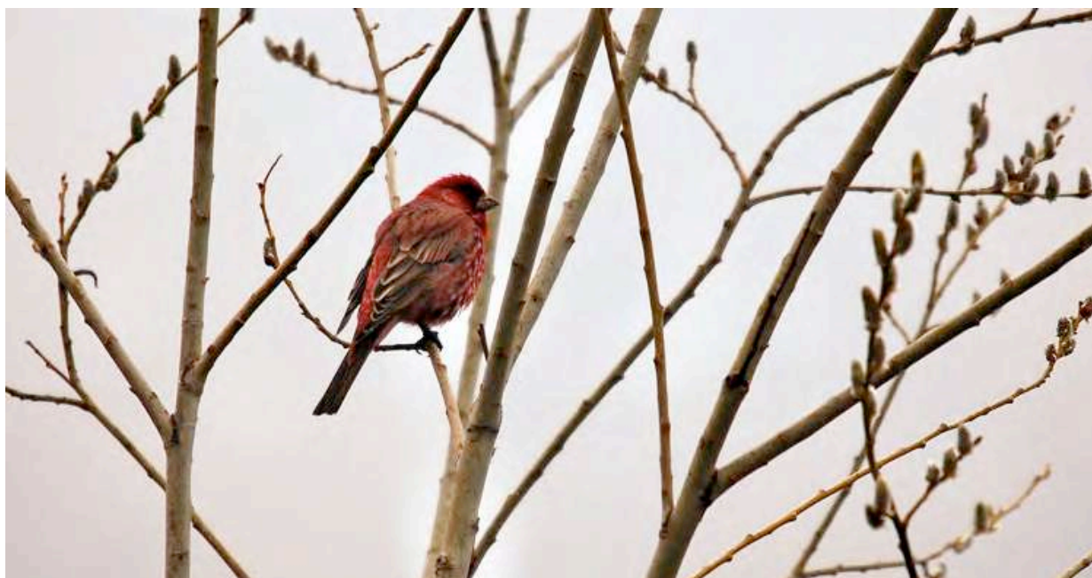
Picture 14: male Great Rosefinch. 22.04.2011, Stephansminda.

Several flocks (about 30 ind. including at least 10 males) in the bushes south of Stephansminda (about 500 m east of the electricity station) seen on 22.04. and 23.04. Not shy at all (birds were feeding 5 m next to us). One flock seen between the Sameba Church and Stephansminda on 24.04.