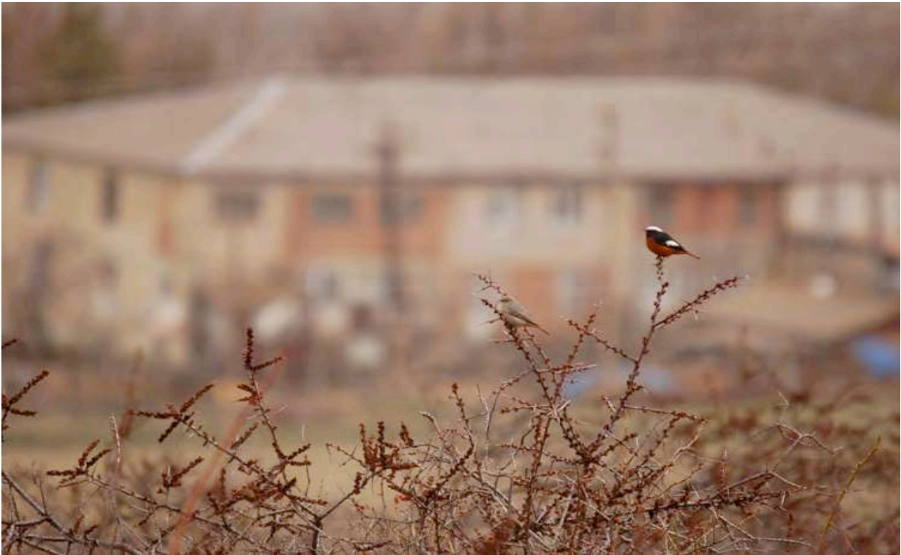
Picture 9: female and male Güldenstädt's Redstart. 22.04.2011, Stephansminda.

Three male and three female birds in the bushes south of Stephansminda (about 500 m east of the electricity station) seen on 22.04. At the same location we saw two males and one female on the next day.